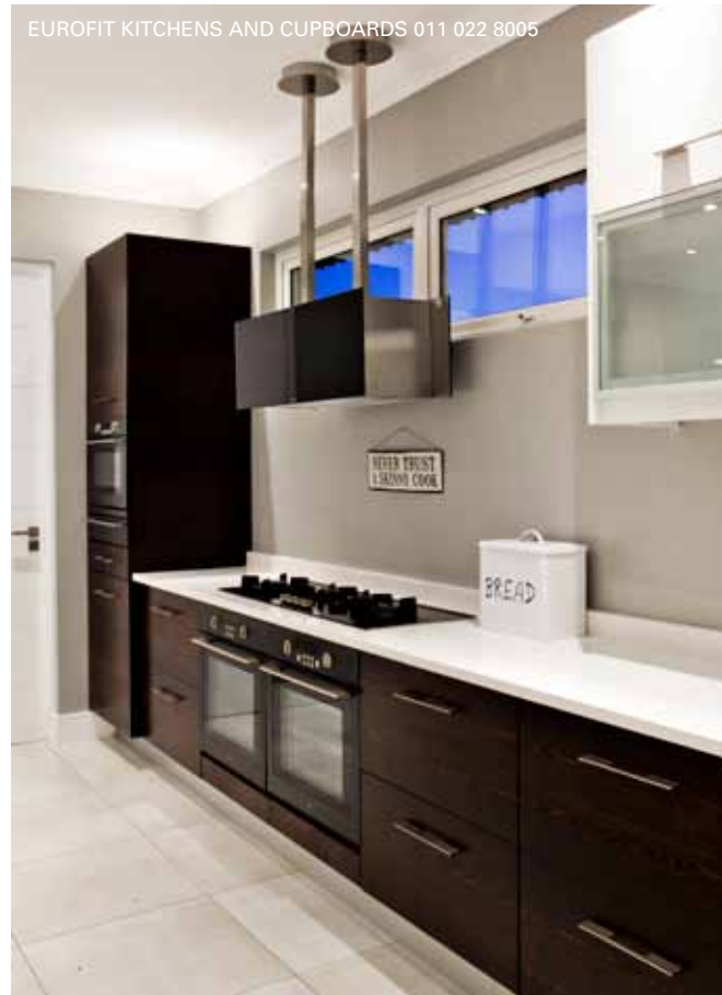
EUROFIT KITCHENS AND CUPBOARDS 011 022 8005