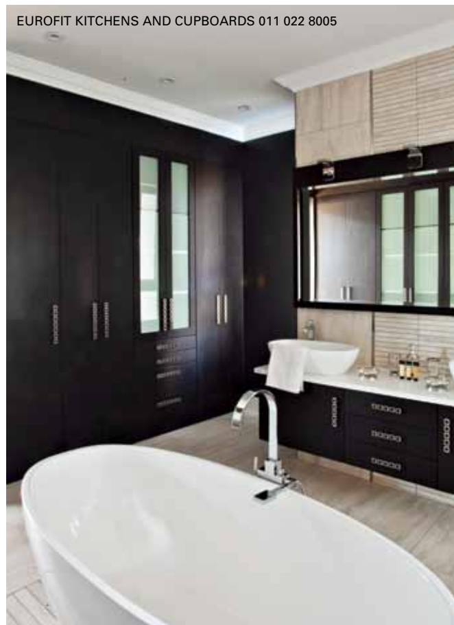
EUROFIT KITCHENS AND CUPBOARDS 011 022 8005

ABOVE LEFT: Eurofit Kitchens and Cupboards was responsible for designing and manufacturing the elegant built-in cupboards and vanities in this home. Form meets functionality in this kitchen, which was designed to have multiple work areas and a raised breakfast nook to accommodate the whole family, as the kitchen is the heart of the home.