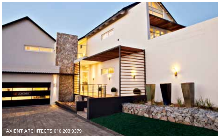
AXIENT ARCHITECTS 010 203 9379

ABOVE: Ivecon Projects has a good understanding of what needs to be done to achieve a prestigious home like this. Attention to detail throughout all stages of this project would later show how the final pieces of the puzzle would come together to present a well-constructed, architectural piece that a distinguished guest in the home would appreciate. With a professional attitude and work ethic, Ivecon Projects boasts a proven track record in residential construction, ensuring that the utmost attention to detail and desired outcome is achieved.