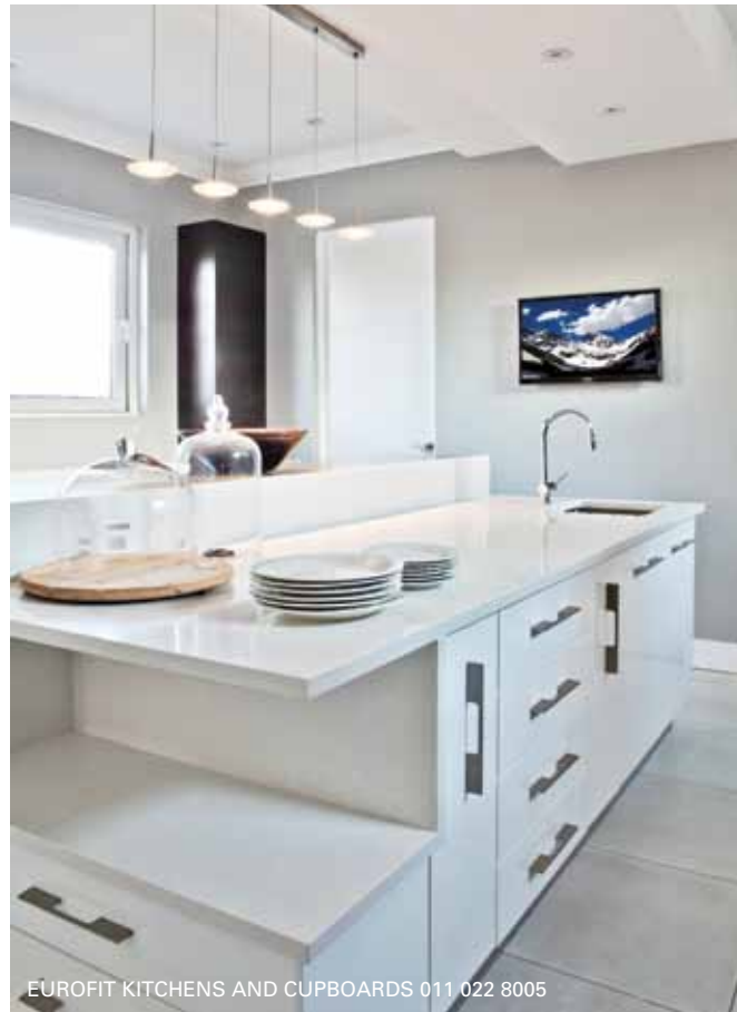
EUROFIT KITCHENS AND CUPBOARDS 011 022 8005