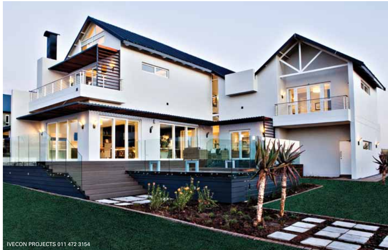
IVECON PROJECTS 011 472 3154

The brief was to design a four-bedroom home. One of the bedrooms fulfills the needs of a guest suite or study, and all four bedrooms have en suite bathrooms. The home had to have a kitchen, with service areas of a full scullery and pantry. The dining and living room are in an open-plan format, with a lounge that is fully kitted with entertainment features and an enclosed patio entertainment area – all flowing out onto a deck area with a swimming pool. Adding to the appeal of the home is the double garage with dimensions larger than normal and domestic quarters included as well.