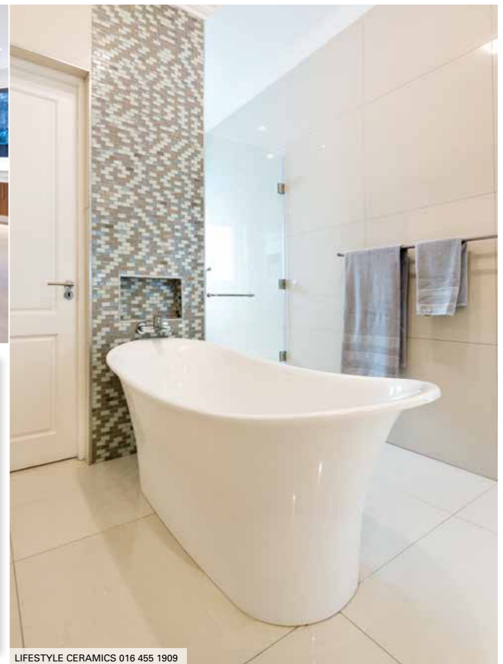
LIFESTYLE CERAMICS 016 455 1909

BELOW: The spiral staircase is one of the most striking architectural features of the home. An interesting mix of materials, textures and hues reflects the owners' eclectic style. To complement the curvy design and tactile undertone of the staircase, the owners selected Corobrik's Roan Satin bricks for a textural focal wall.