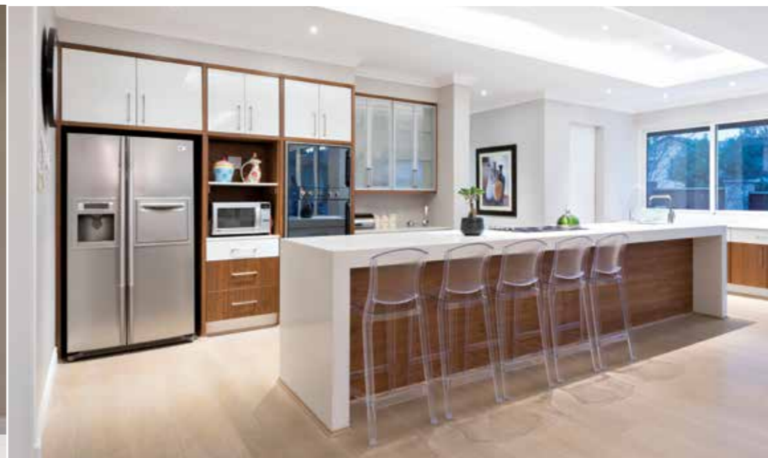
LIFESTYLE CERAMICS 016 455 1909

ABOVE: Syam's Elite 10 is indeed elite, providing 10 burners, a rotisserie kit and a smoker box for the serious braai man. Clearly this BBQ states: go big or go home! Offering a range of cooking solutions, fully fitted with all modern conveniences in one console, allows for many pleasurable braai and cooking experiences.