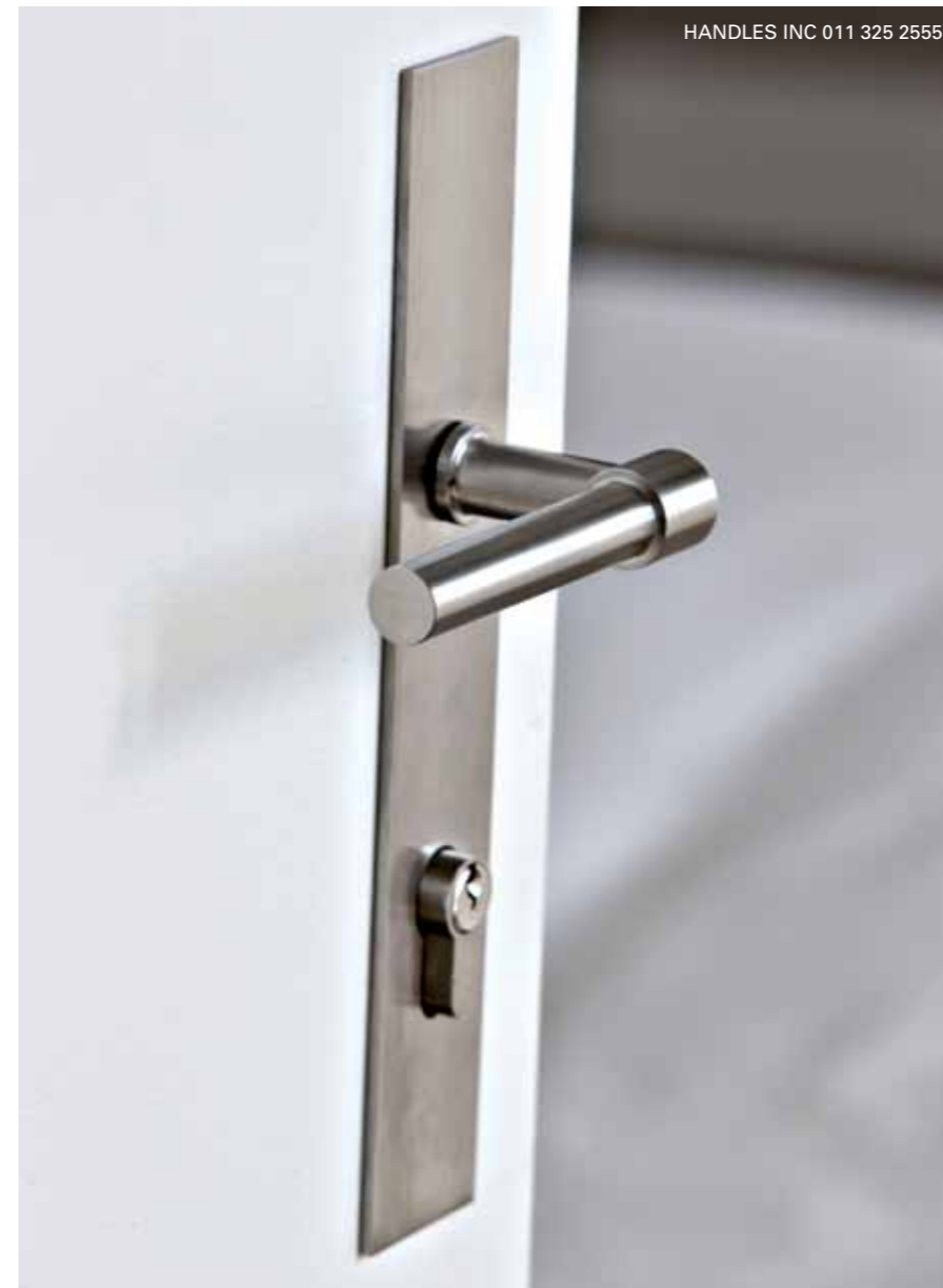
HANDLES INC 011 325 2555