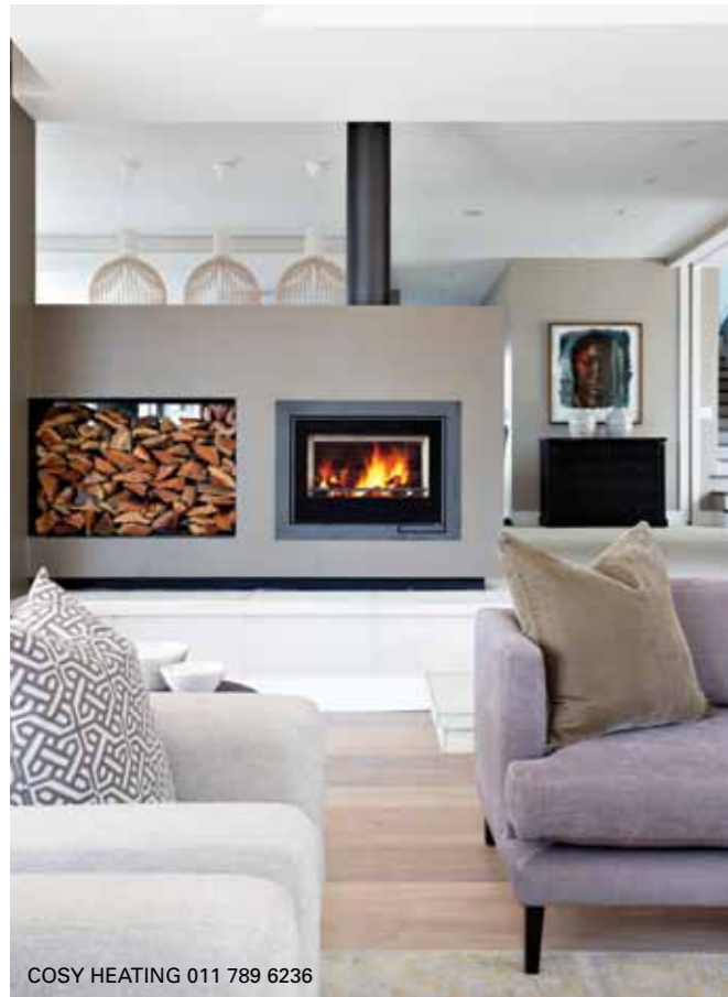
COSY HEATING 011 789 6236

LEFT: Specialising in the sales and installations of fireplaces (wood and gas burning) and braais for domestic homes, Cosy Heating supplied and installed the highly efficient Scan DSA 12 double-sided wood fire (which is capable of heating most of the ground floor of this home), as well as the Jotul G1160 balanced flue gas fire in the main bedroom and the Infiniti Fires charcoal braai on the patio.