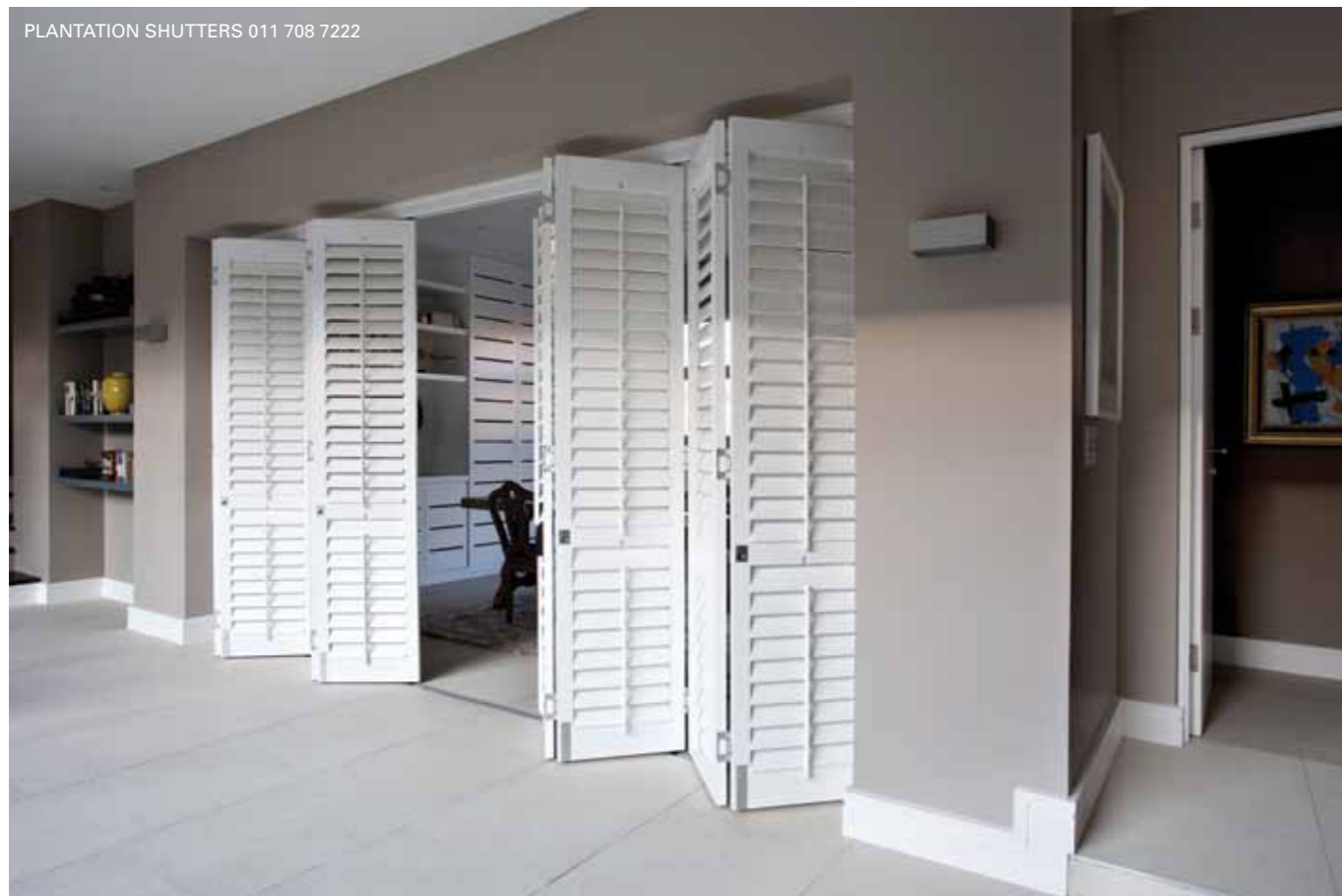
PLANTATION SHUTTERS 011 708 7222

What more could you ask for in a home? While it is shaped in a contemporary yet elegant and comfortable design, meaning that your stress levels will automatically ease the moment you step foot into the home, this sterling abode also allows for all your senses to be captivated, and its green design gives you peace of mind knowing that you are part of the solution to the ever-increasing green issue. ■