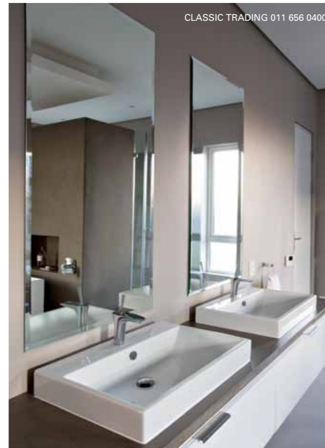
CLASSIC TRADING 011 656 0400

OPPOSITE PAGE ABOVE RIGHT: Stoneform manufactures to the age-old tradition of terrazzo, adapted to reflect the contemporary styles of modern-day living. Bespoke hand-finished cast concrete counters was used throughout, in natural stone colours (unpigmented) for bathroom vanities, floating window ledge, niche counter and a braai server cast with an integrated prep bowl.