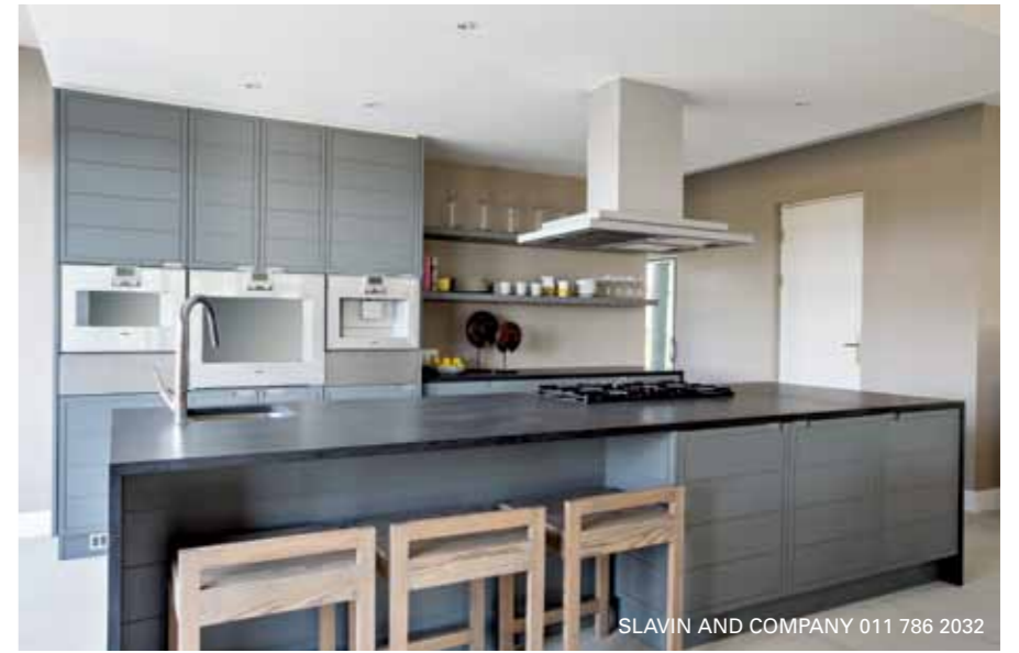
SLAVIN AND COMPANY 011 786 2032

BELOW: Handles Inc supplied the specialist door handles for this unique home. The company used exclusive stainless steel, polished and brushed door handles, adding to the elegance and ambience of each interior. Handles Inc, the exclusive importers of the Piet Boon range of products, is an importer, wholesaler and retailer of the finest Italian, Spanish and German door handles, locks, bathroom accessories and cabinet handles.