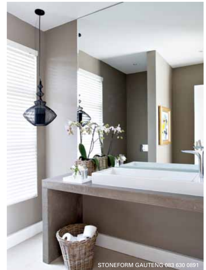
STONEFORM GAUTENG 083 630 0891